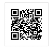
Fantasy Football League Team Registration